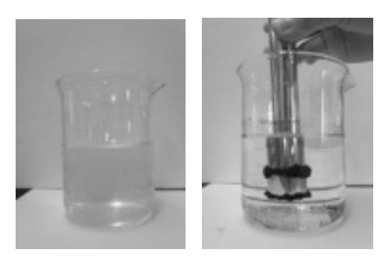
Figure 1: Water Purification by Magnetic Flocculant

The experiments performed in the continuous visiting classes have already described in previous reports (Yasuzawa, 2010; Minagawa, 2014). In the water purification experiments, for example, tap water containing green tea powder instantaneously changed to transparent by removing impurity with a magnetic flocculant as shown in Figure 1. The obvious change in the appearance of water from turbid to clear states attracted much attention of high school students. As another example, in the experiments of super-hydrophilic/hydrophobic surfaces (Figure 2), the opposite properties of modified surfaces were easily observed by eyes (Figure 3) and also evaluated by measuring the contact angle (Figure 4). TAs explained principles of observed phenomena and evaluation techniques on the basis of their knowledge and experience of research activities in the university.